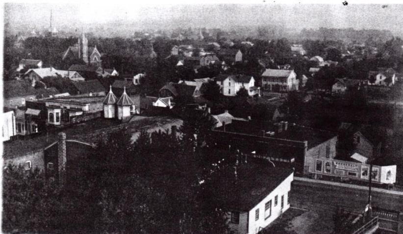
An aerial view of West Monroe St.

The Roosevelt Theatre, sometime between October, 1933 & January, 1945.