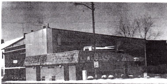
Senior Citizens Building at 10-12 West Monroe St.

Crown Equipment Corp. is now reinforcing and remodeling the old theatre building. Maybe one day we will again have a "Crown Theatre" in New Bremen???